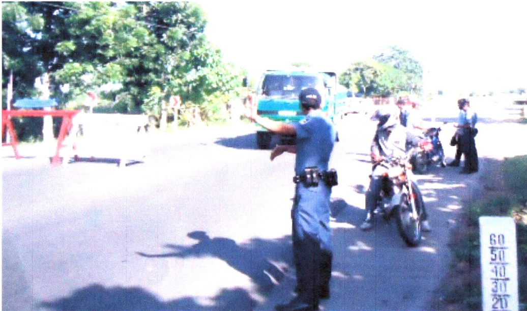
Photos taken during the implementation of Discipline Zone in Different Municipalities together with the Representatives from the Local Government Unit