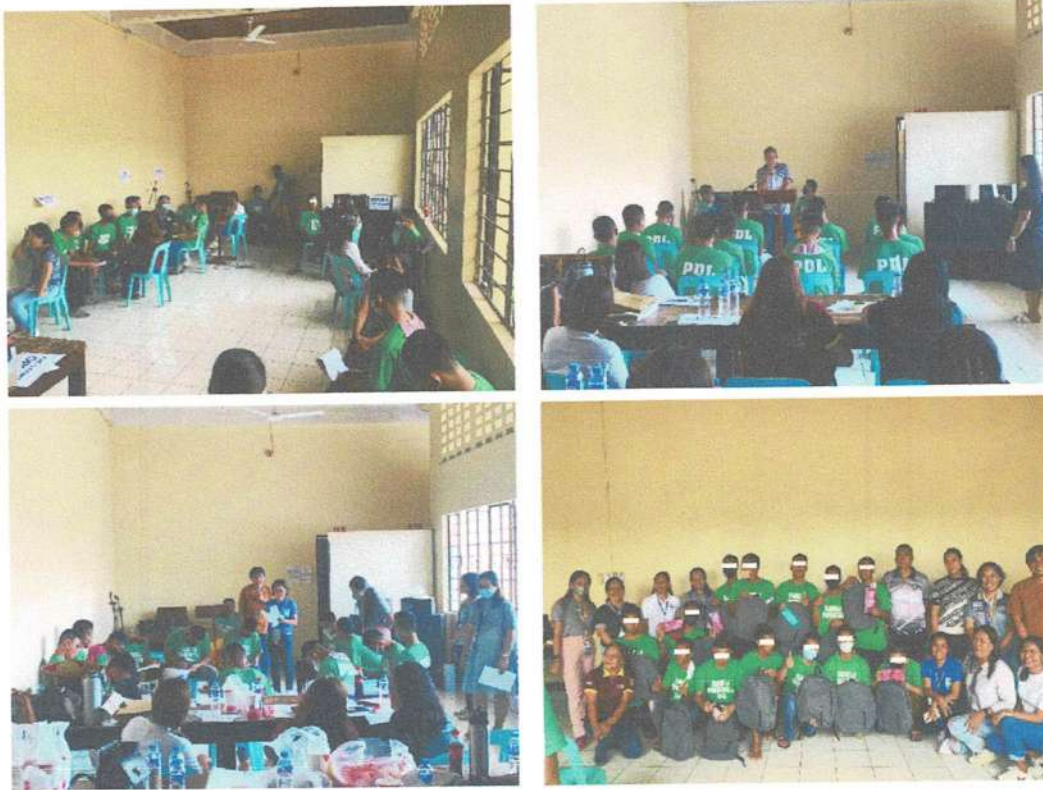
Fig. 24- Photograph showing the Court Social Welfare Officers from Regional Trial Court (RTC) City of Ilagan, Isabela & Regional Trial Court (RTC) Cauayan City, Isabela, Social Workers from Provincial Social Welfare and Development Office (PSWDO) & Social Workers from Municipal Social Welfare and Development Offices (MSWDO) who conducted Jail Visit and Kamustahan Session with the Children in Conflict with the Law (CICL) at Isabela Provincial Jail, Alibagu, City of Ilagan, Isabela on August 25, 2023.