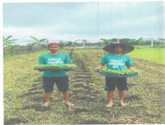
Fig. 3- Photograph showing the PDLs/Inmates vegetable garden located at the Northern part of IPJ Compound.