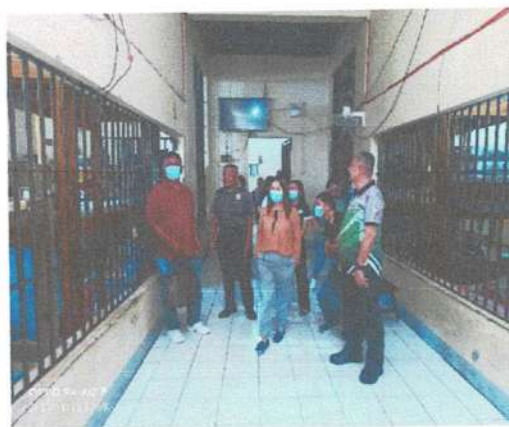
Fig. 33- Photograph showing Judge Jennifer S. Loveria of Regional Trial Court Br. 22, Cabagan, Isabela who conducted jail visitation on November 13, 2023.