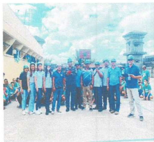
Fig. 18- Photograph showing Isabela Provincial Jail Personnel and PDLs who participated in the 2 nd Quarter Nationwide Simultaneous Earthquake Drill for CY 2023 on June 8, 2023.