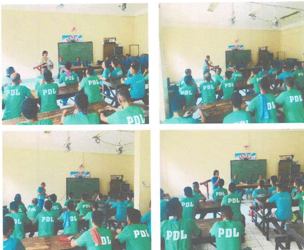
Fig. 30- Photograph showing the TESDA Isabela, Public Employment Service (PESO) Isabela and Isabela Provincial Jail who launched Training for Work Scholarship Program – Special Skills Training Program intended for PDLs on October 9, 2023.

The objective of the skills training program is to equip the PDL with technical/vocational skills which they can use in seeking employment or starting their own business after release from confinement and to make PDLs as competitive as other potential job seekers.