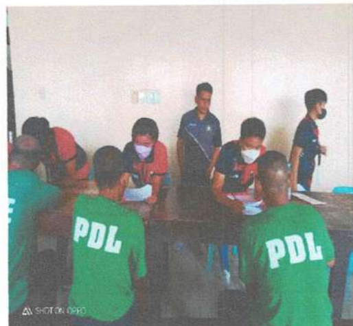
Fig. 14- Photograph showing Criminology students of Isabela State University Echague Campus who conducted interview to PDLs in connection with their thesis on April 15, 2023.