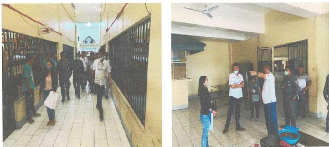
Fig. 12- Photograph showing HON. JUDGE JEFFREY CABASAL and company who conducted jail visitation on March 31, 2023.