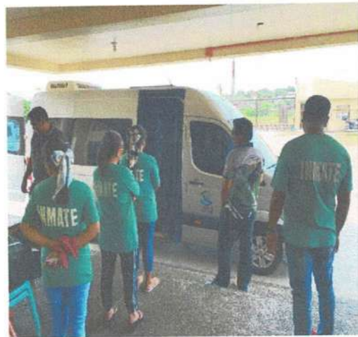
Fig. 13- Photograph showing City Health Office 1, City of Ilagan who conducted X-Ray Examination to all PDLs/Inmates and some IPJ personnel and distributed food pack intended for PDLs/Inmates on April 3, 2023.