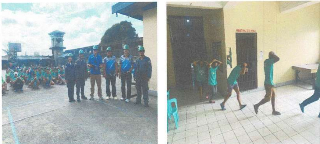
Fig. 11- Photograph showing the Isabela Provincial Jail Personnel and PDLs who participated in the First Quarter Nationwide Simultaneous Earthquake Drill for CY 2023 on March 9, 2023.