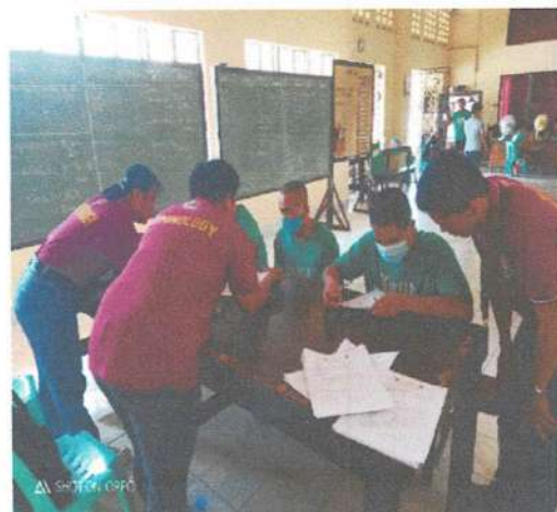
Fig. 15- Photograph showing Criminology students of Isabela State University Cabagan Campus who conducted interview to PDLs in connection with their thesis on April 21, 2023.