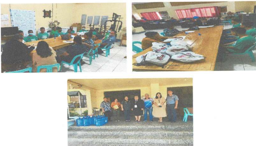
Fig. 20- Photograph showing Regional Juvenile Justice and Welfare Council (RJJWC), Public Attorney's Office, Bureau of Jail Management and Penology RO2 and Commission on Human Rights RO2 who conducted quarterly jail monitoring, interviewed Children In-Conflict with the Law (CICL) and distributed hygiene kits on July 20, 2023.