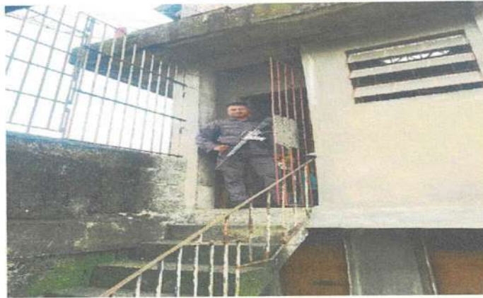
Fig. 7- Photograph showing the Tower 1 Guard house of Isabela Provincial Jail