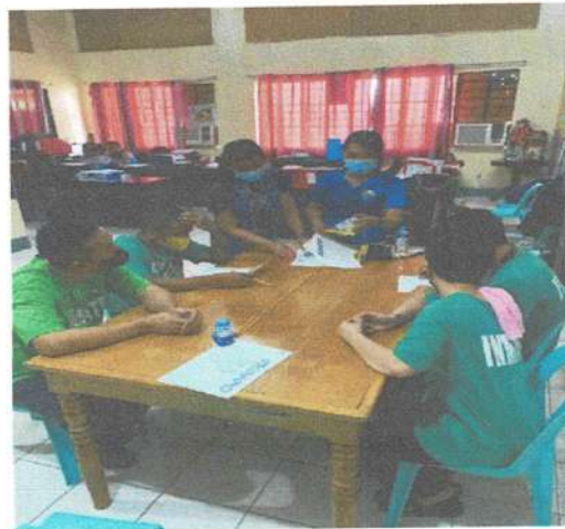
Fig. 16- Photograph showing a 2 nd year post graduate student taking up Master of Psychology at Saint Paul University Philippines – Tuguegarao City who conducted research study entitled “Self-Esteem and Psychological Distress of Illegal Drug Users in the Province of Isabela” on May 19, 2023.