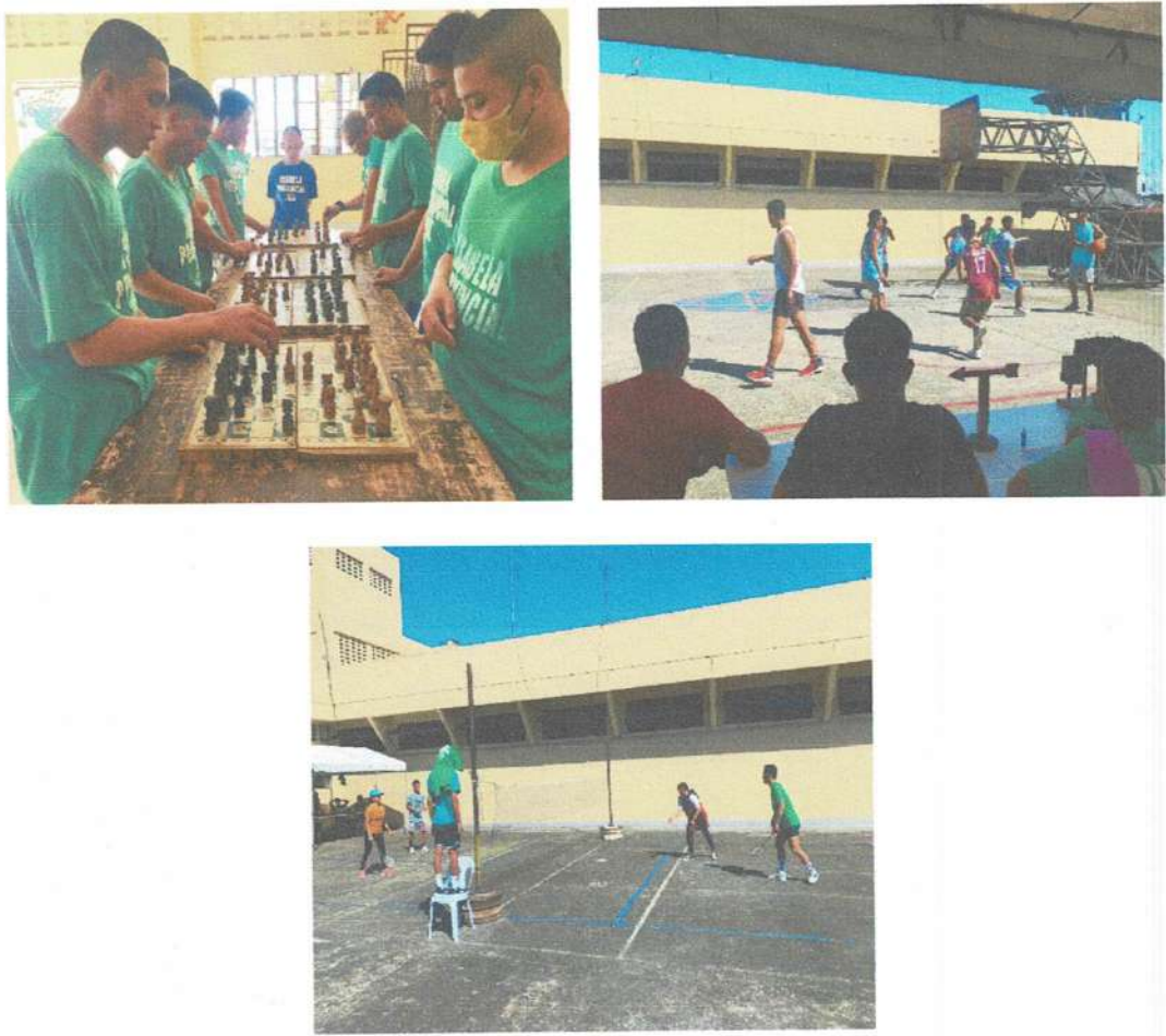
Fig. 5- Photographs showing inmates/PDLs on their recreational activities.

The Isabela Provincial Jail is maintaining three (3) Guard Houses. These facilities serve as security measures being maintained by the Jail Personnel.