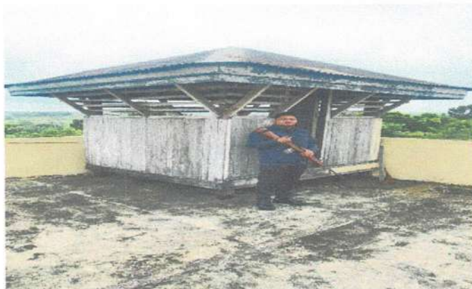
Fig. 8- Photograph showing the Tower 2 Guard house of Isabela Provincial Jail