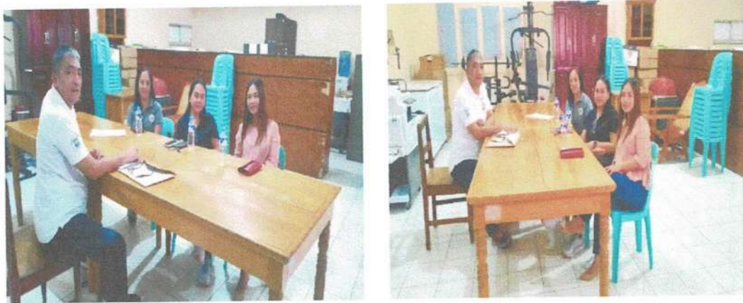
Fig. 29- Photograph showing Staff of Regional Trial Court Br. 16 and Office of the Clerk of Court City of Ilagan, Isabela who conducted jail visitation on September 29, 2023.