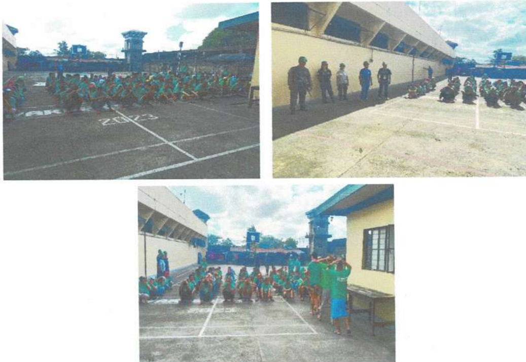
Fig. 25- Photograph showing Isabela Provincial Jail Personnel and PDLs who participated in the 3 RD Quarter Nationwide Simultaneous Earthquake Drill for CY 2023 on September 7, 2024.