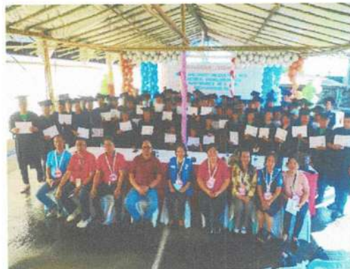
Fig. 35- Photograph showing the graduation ceremony of seventy (70) Persons Deprived of Liberty (PDLs) who have successfully completed their training in