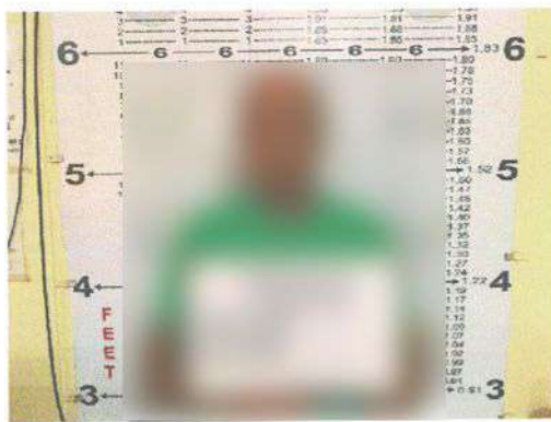
Fig. 1- Photograph showing five (5) Insular Prisoners committed at National Bilibid Prison Muntinlupa City on February 3, 2023. 1. [REDACTED]; 2. [REDACTED]; 3. [REDACTED]; 4. [REDACTED] and 5. [REDACTED]