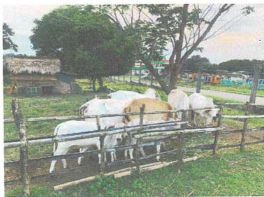
Fig. 4- Photograph showing the livestock project of Isabela Provincial Jail.