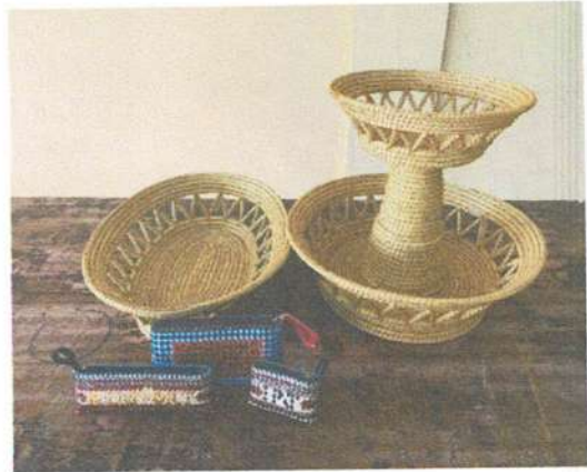
Fig. 2- Photograph showing finished handy craft project made of COGON AND RECYCLED materials.