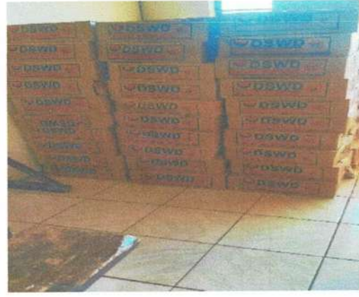
Fig. 26- Photograph showing relief goods intended for Inmates/PDLs which was distributed by the Provincial Social Welfare and Development (PSWD), City of Ilagan, Isabela on September 7, 2023.