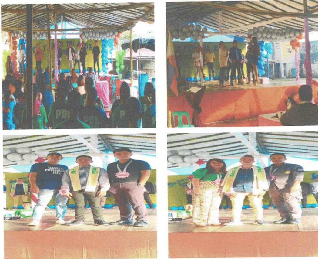
Fig. 36- Photograph showing Isabela Provincial Jail PDLs celebrated their Christmas Program. Highlights of their activities entitled “That’s My Kosa 2023”

Bread and Pastry Production NC II, Electrical Installation & Maintenance and Dressmaking at the Isabela Provincial Jail in collaboration with Technical Education and Skills Development Authority (TESDA), the Isabela School of Arts and Trades (ISAT), Isabela Provincial Training Center (IPTC), and the Public Employment Service Office Isabela (PESO-Isabela) on December 19, 2023.