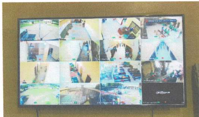
Fig. 9- Photograph showing the 16 capacity CCTV of the Isabela Provincial Jail