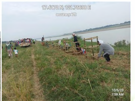
Bamboo planting utilizing the Cash for Work beneficiaries at Sto. Tomas, Isabela on October 6, 2023.