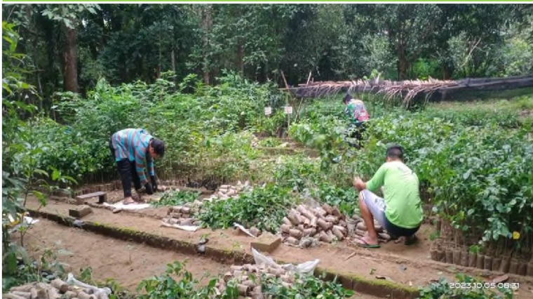
Pictures of the activities conducted at the ENRO Provincial Nursery for the month of October, 2023