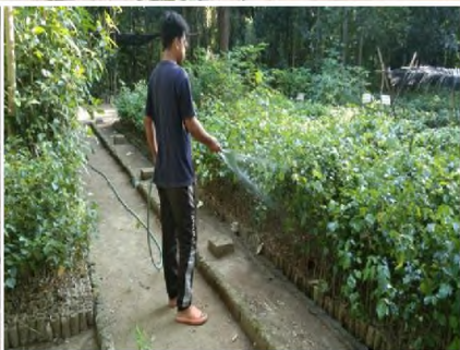
Clearing activities and beautification within the pathways of the Isabela Provincial Eco-Park for the month of October, 2023.