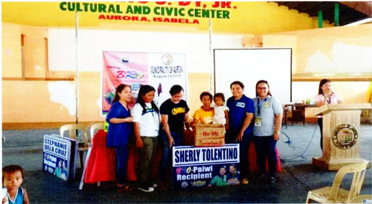
The Paiwi ni BRO Program of the Provincial Government of Isabela (PGI), conducted a Seminar on Backyard Range Chicken Production and dispersal of 1,000 heads chicks to 100 identified families with malnourished child/children from Aurora, Isabela last August 23, 2018