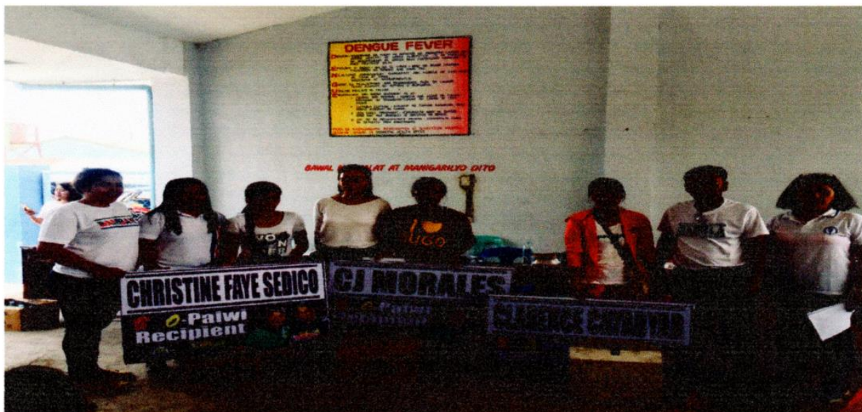
The Paiwi ni BRO Program of the Provincial Government of Isabela (PGI), conducted a Seminar on Backyard Range Chicken Production and dispersal of 810heads chicks to 81 identified families with malnourished child/children from San Isidro, Isabela last August 24, 2018.