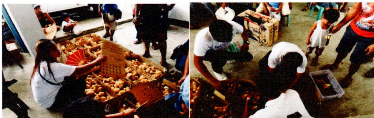
The Paiwi ni BRO Program of the Provincial Government of Isabela (PGI), conducted a Seminar on Backyard Range Chicken Production and dispersal of 1,190 heads chicks to 119 identified families with malnourished child/children from San Mateo, Isabela last September 7, 2018.