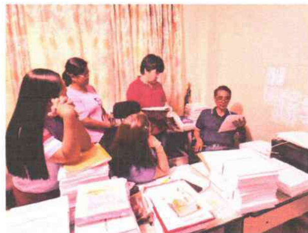
RAMON, ISABELA (June 20, 2025)