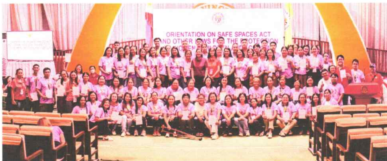
Orientation on Safe Spaces Act and Other Protective Laws (June 25, 2025)