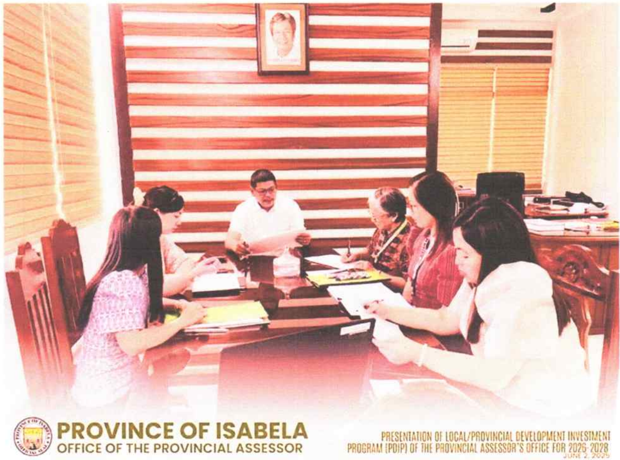
Presentation of the Local/Provincial Development Investment Program (PDIP) (June 2, 2025)