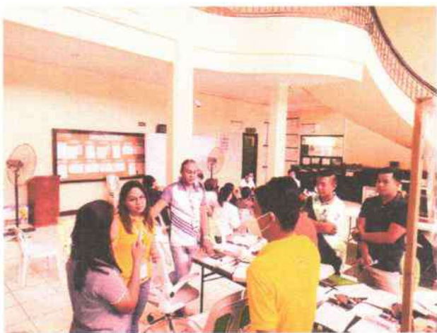
ANGADANAN, ISABELA (June 19, 2025)