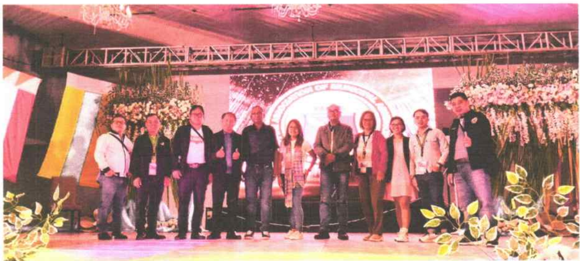
PAMAS National Convention in Zamboanga (June 2-6, 2025)