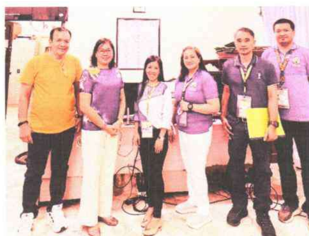
CAUAYAN CITY, ISABELA (June 27, 2025)