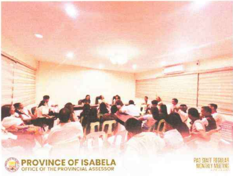
PAO Staff Regular Monthly Meeting (June 23, 2025)