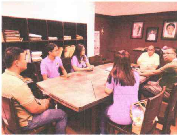
ECHAGUE, ISABELA (June 20, 2025)