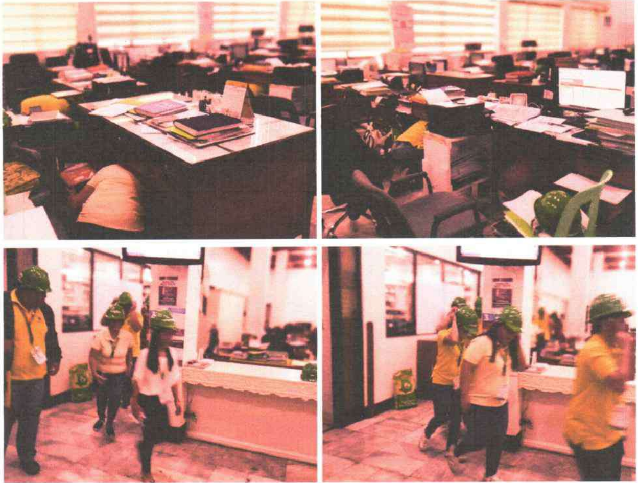
Nationwide Simultaneous Earthquake Drill (NSED) (June 19, 2025)