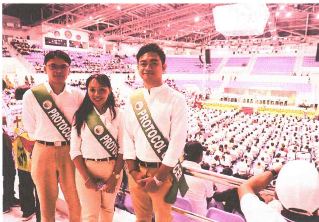
Oath-Taking Ceremony of the newly Elected Officials in the Province of Isabela on June 30, 2025 at the Capital ARENA