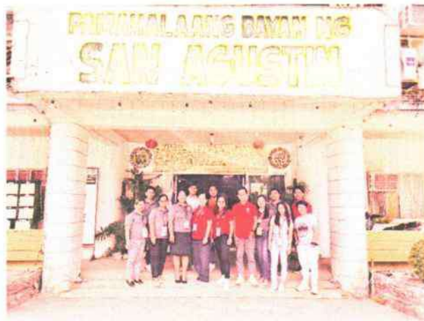
SAN AGUSTIN, ISABELA (June 25, 2025)