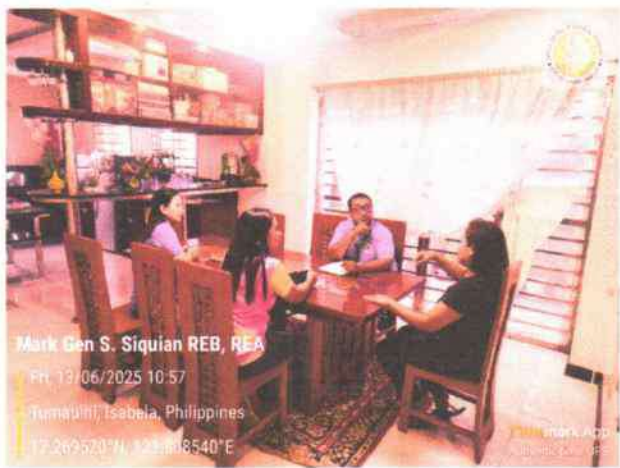
SAN MARIANO, ISABELA (June 17, 2025)