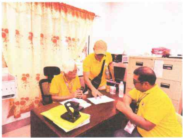
TUMAUINI, ISABELA (June 13, 2025)