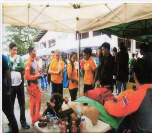
Farmer's Congress at Naguilian, Isabela last January 18, 2018