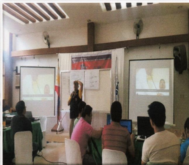
NDRRMC Information Management System Training (NIMS) at Hotel Carmelita, Tuguegarao City, Cagayan last January 22-24, 2018