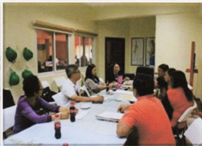
Japan International Cooperative Agency (JICA) Disaster Risk Reduction and Management Capacity Enhancement Project (DRRM-CEP) Project Evaluation at Conference Room, PDRRMO Headquarters, Alibagu, City of Ilagan, Isabela last January 31, 2018