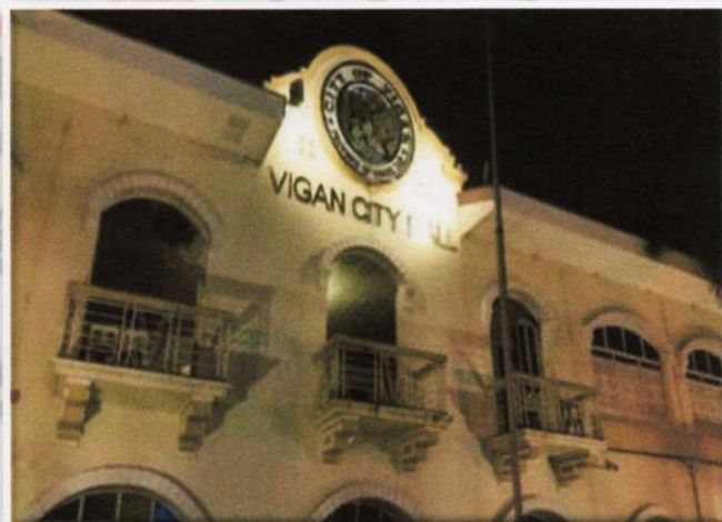
Orientation and Workshop on the implementation of DRRM projects to be conducted by the Philippine Red Cross National Headquarters/German Red Cross at Vigan, Ilocos Sur last January 31, 2018