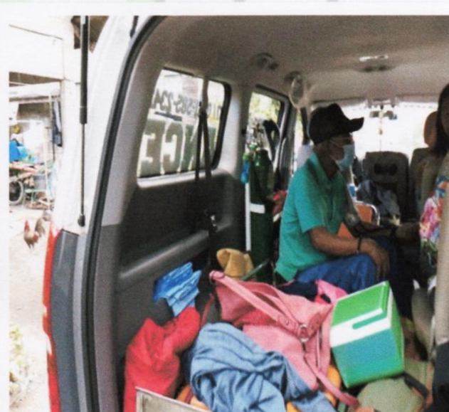
Interfacility Transfer of patient at Makati Medical Center last January 21-23, 2018